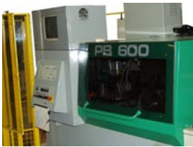
Tube Forming Machine

If your company needs copper tube fabricated for assembly or sub-assemblies, KOOLTRONIC is your complete source. We currently undertake tube fabrication and bending jobs for many major industries. We can shape 1/8", 1/4" & 3/8" & 1/2" outer diameter copper tubing. For 1/4", 3/8" and 1/2" tubes, one end can be expanded (swage) to receive the outer diameter of the same tube, reducing the need for a fitting.