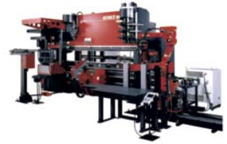
Automated Robotic Press Brake

As a resource for contract assembly, Kooltronic offers mechanical and electromechanical assembly, prototype, sub-assembly, pre-production fabrication and full system assembly to meet your needs. Our state-of-the-art metal fabrication and assembly line facilities are a cost-effective alternative to shipping your projects overseas. With sixty years experience, Kooltronic is quality-oriented and dedicated to customer satisfaction. Kooltronic is RoHS compliant, ISO 9001:2015 certified and UL certified.