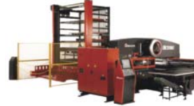
EM Turret with PRIIUL300