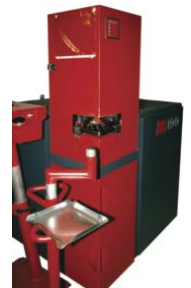
Corner Forming Machine

Our state-of-the-art EdgeMaster 100 corner forming machine is capable of producing custom trays and pans with rapid turn around time. This unique process forms corners to produce a pan shaped part from a solid rectangle of metal, eliminating welding and finishing. Cold rolled steel up to 0.125 inches can be formed in almost any combination of flange bending radius and actual corner radius. Aluminum and other formable alloys may also be processed.