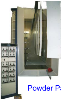
Powder Paint Booth

Offers a variety of coatings and colors. Call us for your custom color needs. All powder-coated parts are run through our five-stage pretreatment system to ensure adhesion and superior corrosion resistance. As a "green" step, KOOLTRONIC utilizes a closed-loop wash system that reclaims particulates and prevents their release into the environment.